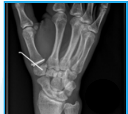
Above: Early post-operative imaging