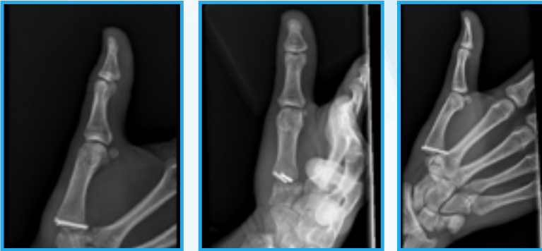
Above: Final post-operative imaging

At follow-up, ten weeks postoperatively, x-rays of the right thumb showed stable hardware placement and a minimally visible fracture line. The patient had excellent active range of motion and no pain or tenderness. He was allowed to advance activities to tolerance. Clinical pictures show equal motion between the operative and contralateral thumb.