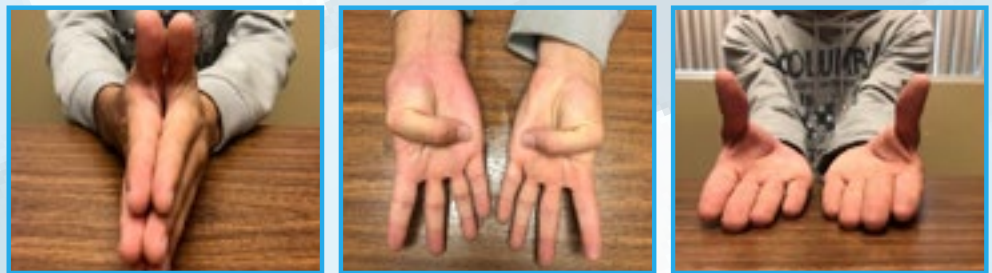
Above: Clinical pictures illustrating motion